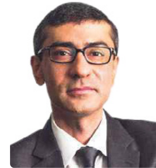
Rajeev Suri CEO Inmarsat