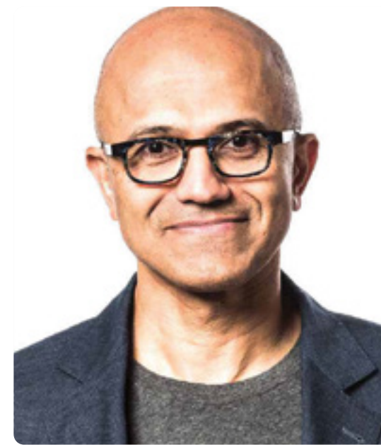
Satya Nadella CEO Microsoft Corporation