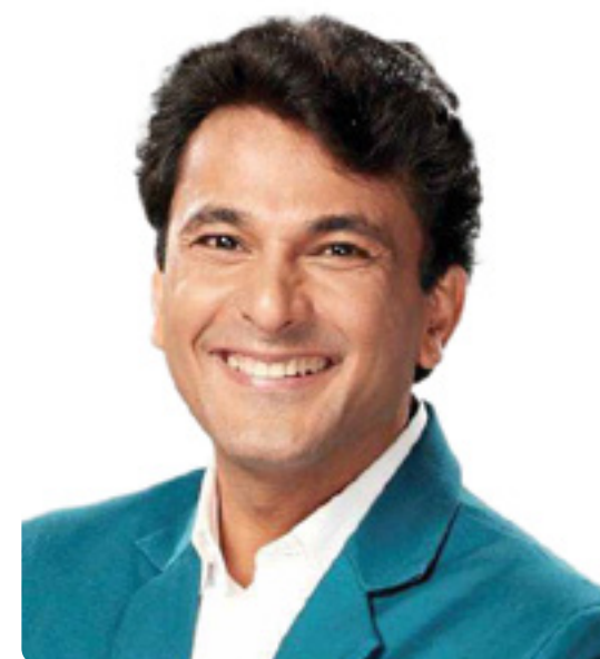
Vikas Khanna Michelin Star Chef