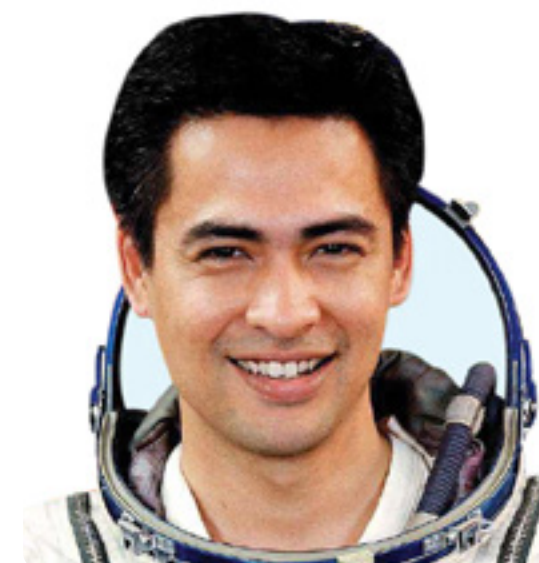
Dato Dr. Sheikh Muszaphar Malaysia's First Astronaut